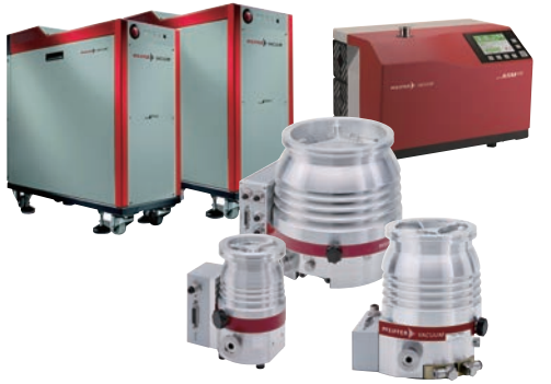
Pfeiffer Vaccum Technology AG Turbo-Molecular Pump, Dry Pump Helium Leak Detector