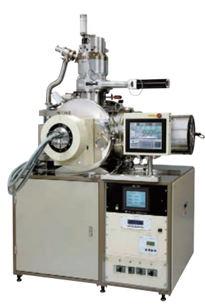
NS Corporation IBE System

Hakuto also proposes and sells Laser cutting and welding systems which meet customer needs with Fiber Lasers and optical components.