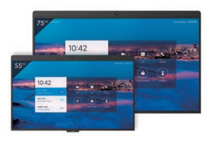
Video Conferencing System