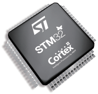
STMicroelectronics 8bit 32bitMCUs, Automotive ICs, Memory, Discrete