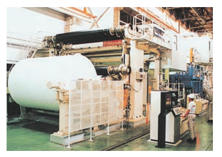
Pulp & Paper Industry