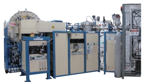
National Electrostatics Corp. Radio Carbon Dating System (Pelletron Accelerator)