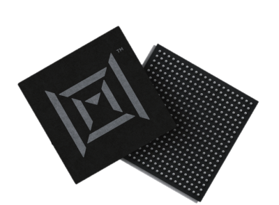
Marvell Semiconductor, Inc. Micro Processor